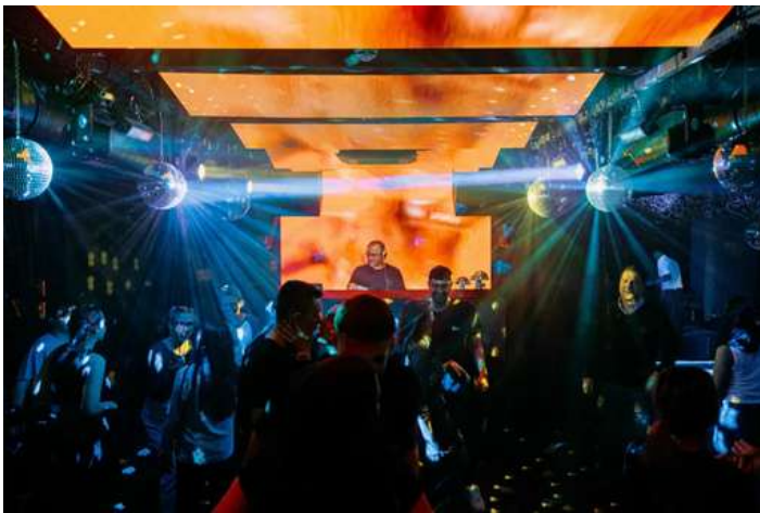
02 ALDEA CLUB