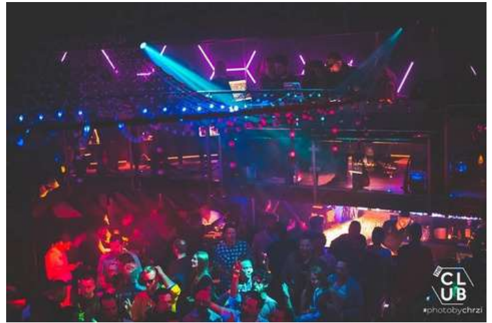
01 THE CLUB