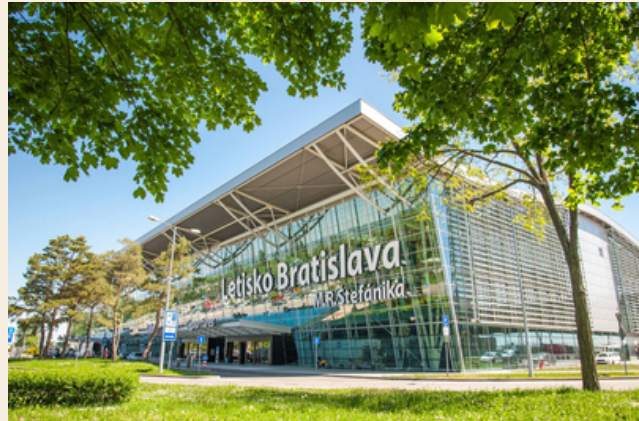
BRATISLAVA LETISKO AIRPORT