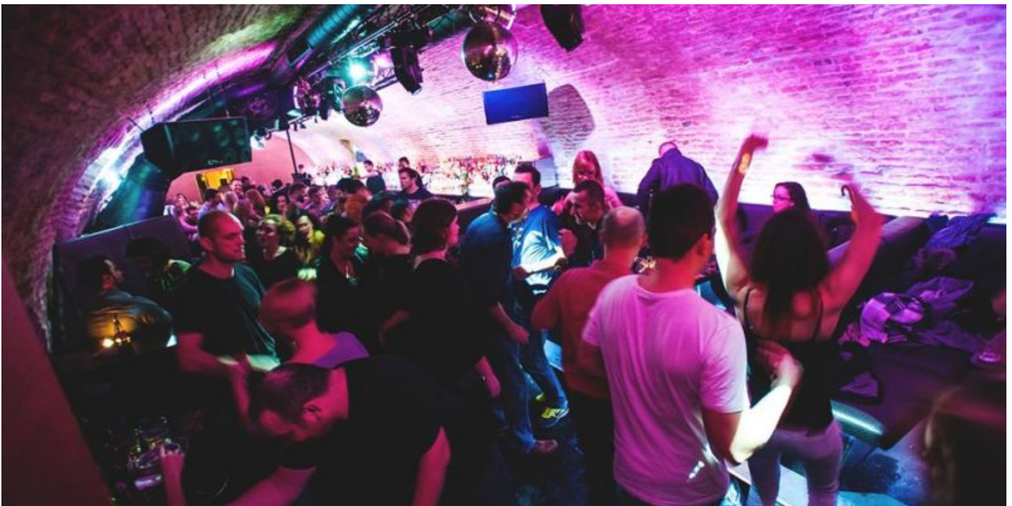
04 RIO GRANDE NIGHT BAR