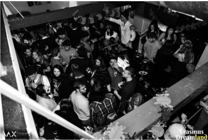
02 ERASMUS DREAMLAND