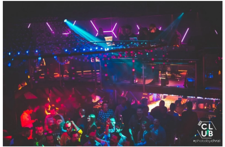
01 THE CLUB